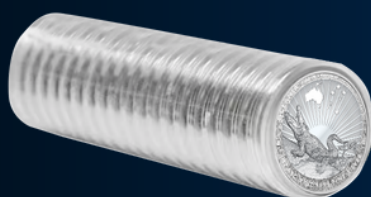
Rolls of 25 coins