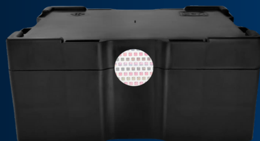
Monster Box (500 coins) 7